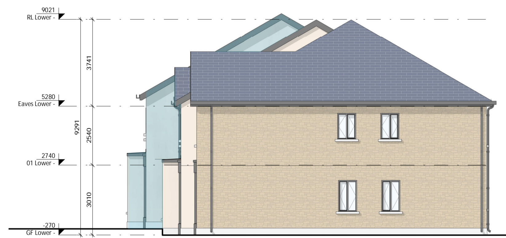
3 Side Elevation 02 1:100