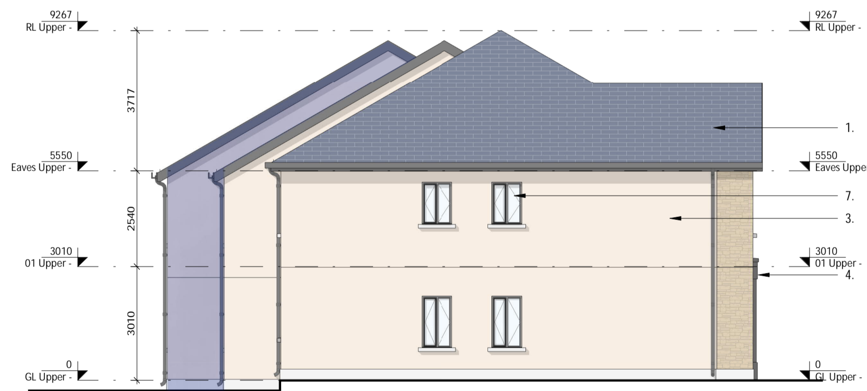
4 Side Elevation 01 1:100